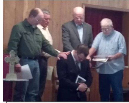
Being Ordained @ Cummings, KS.