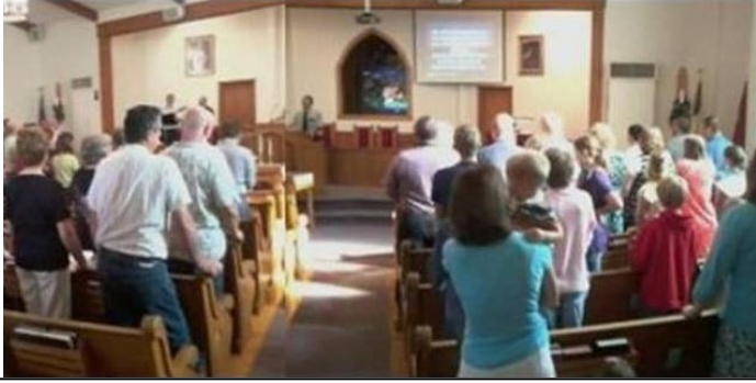
Country Church that grew from 50-100 in less than six months.